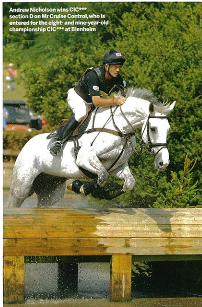
Andrew Nicholson wins CIC*** section D on Mr Cruise Control, who is entered for the eight- and nine-year-old championship CIC*** at Blenheim